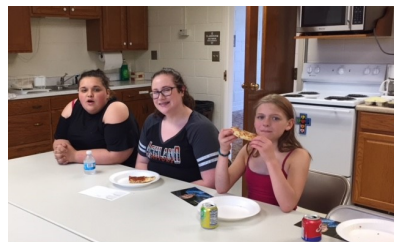
We love pizza!!